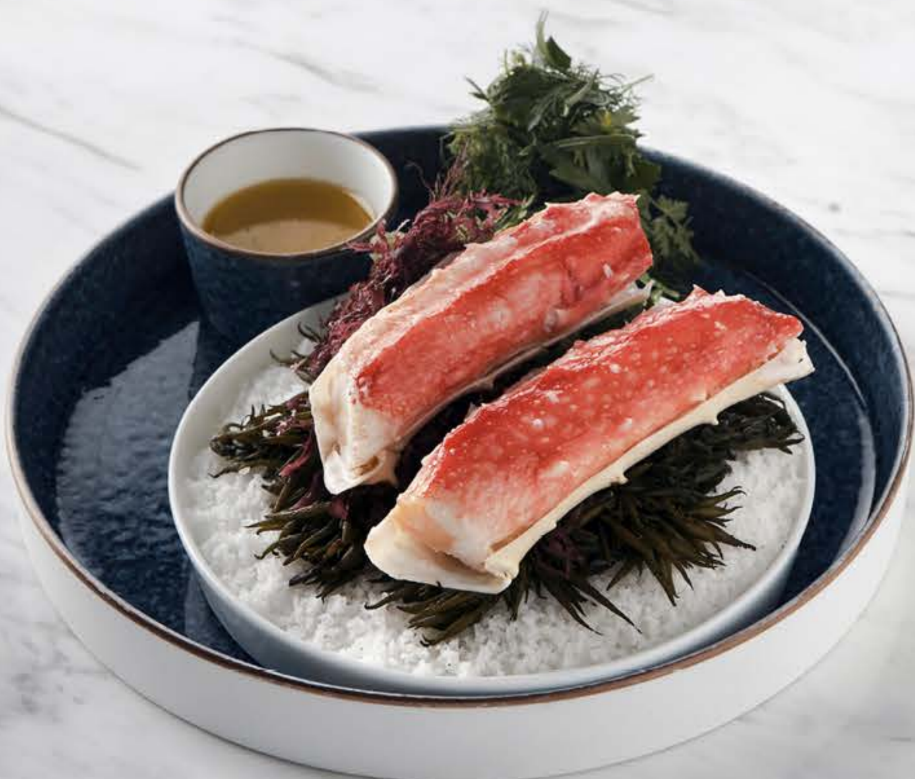
烟熏帝王蟹脚 Smoked king crab legs