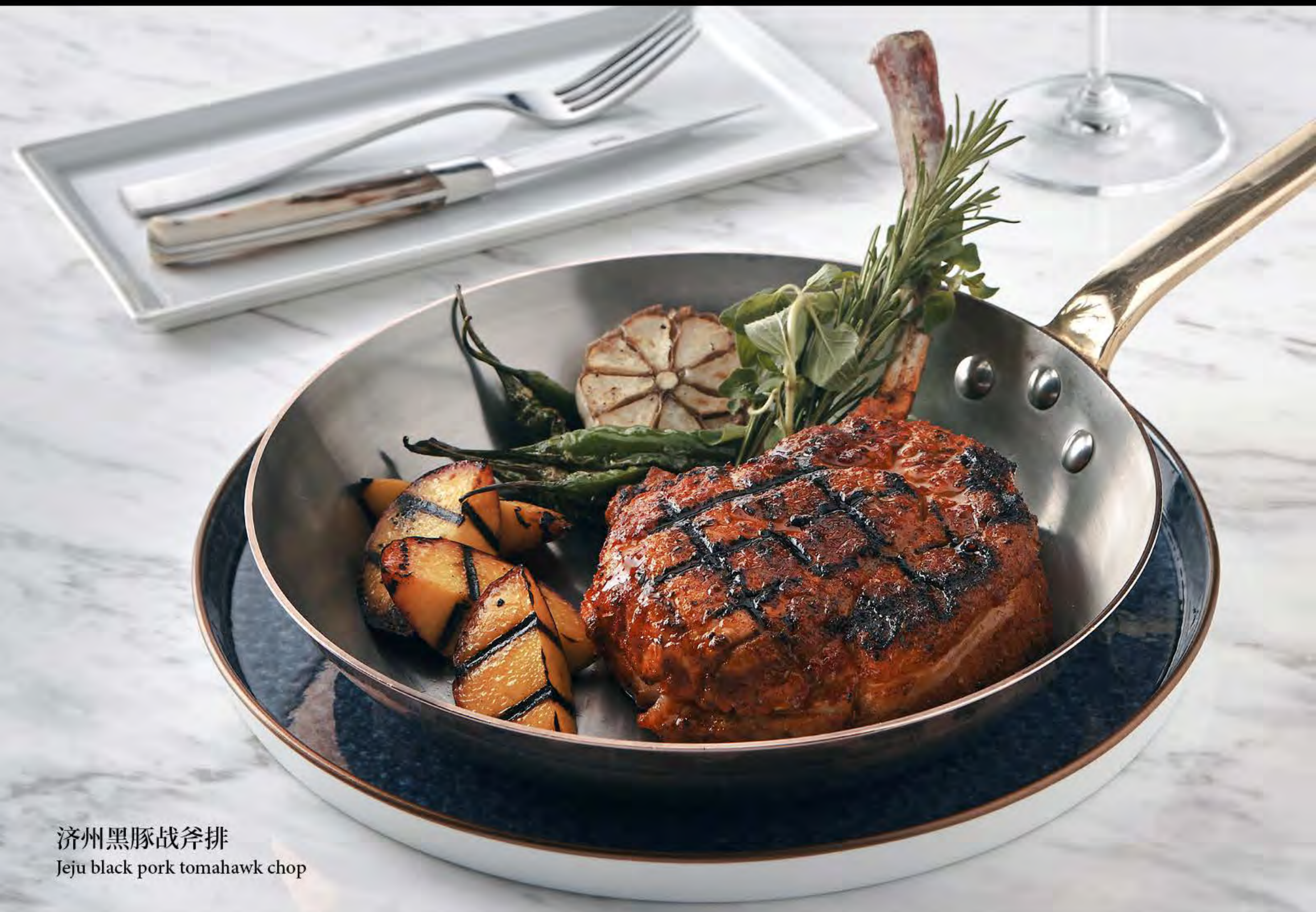
济州黑豚战斧排 Jeju black pork tomahawk chop