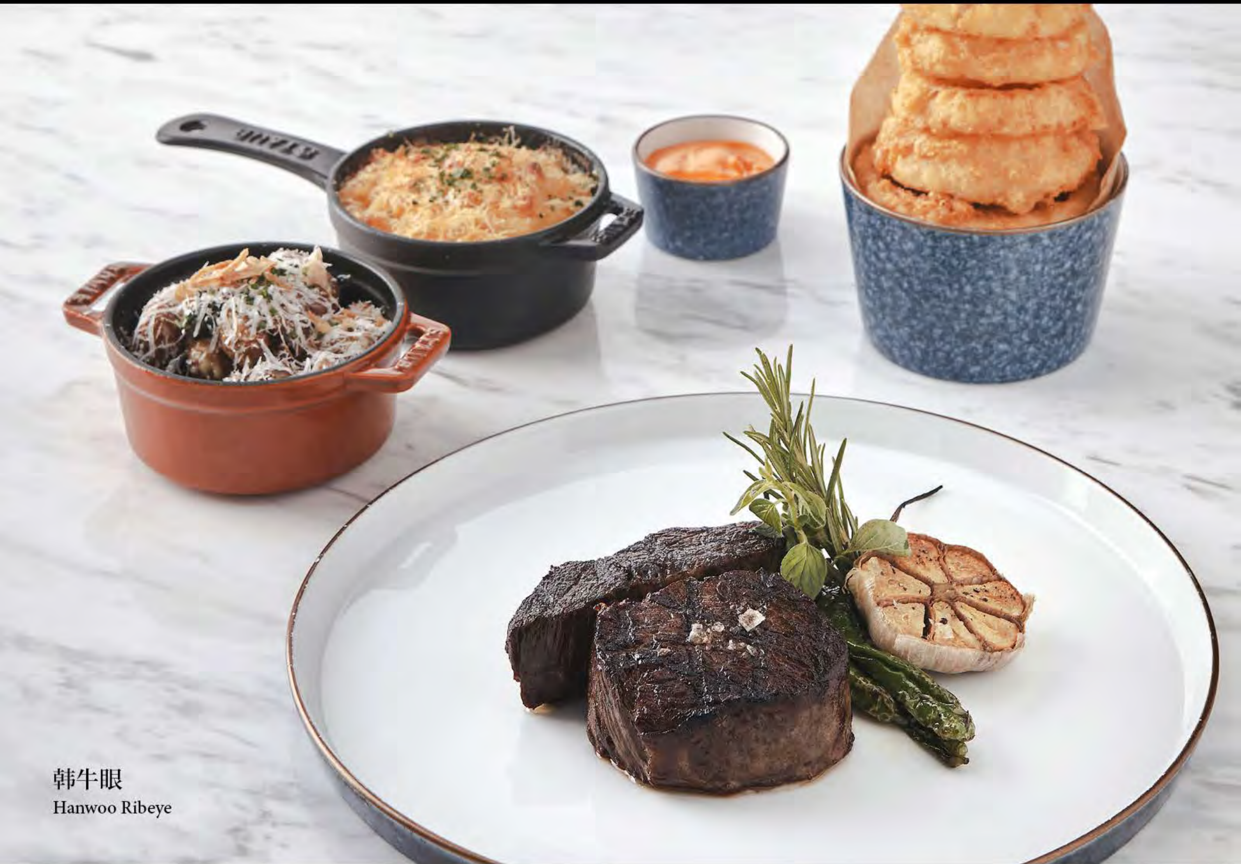
韩牛眼 Hanwoo Ribeye