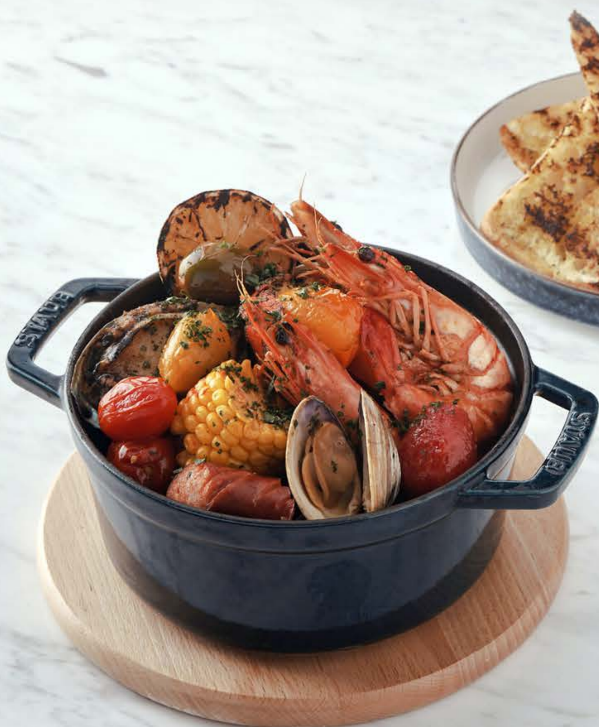
济州超级碗 Jeju seafood boil