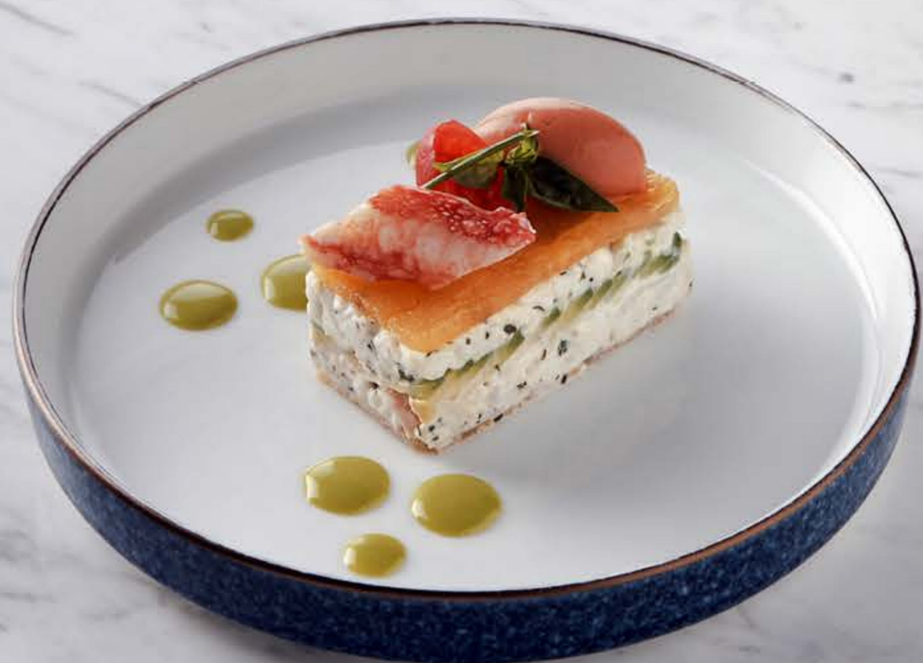
帝王蟹沙拉 King crab salad