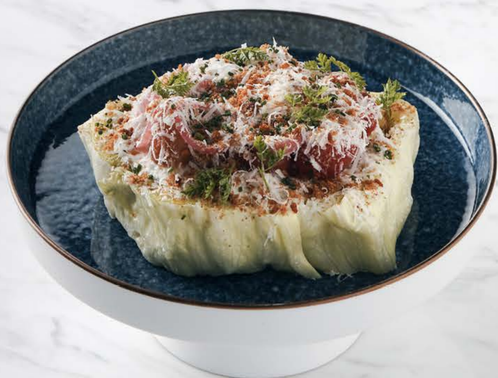
莴苣沙拉 Iceberg wedge salad